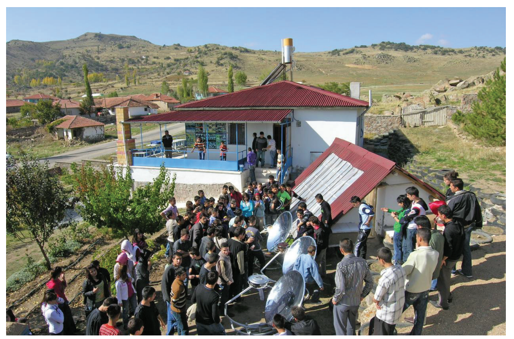
Figure 1. The Kerkenes Eco-Center provides facilities for students and visitors. The Iron Age capital on the Kerkenes Dağ forms a backdrop while at the Erdoğan Akdağ Center for Research and Education solar cookers and a bioclimatic straw bale greenhouse demonstrate how renewable energy can be used for sustainable rural development.

seventh century BCE. This combination of cultural heritage and a beautiful natural setting in a rural environment makes the place an attractive destination for casual visitors as well as for groups of tourists, whether they come from Turkey or beyond. The Kerkenes Eco-Center was initiated in 2002 to encourage village and local development alongside the research that started in 1993 at the nearby ancient city.