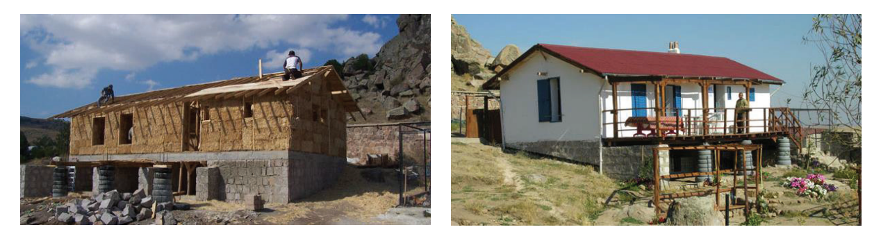
Figure 5. The construction of the Kerkenes Strawbale House was started in 2004 and completed in 2005.