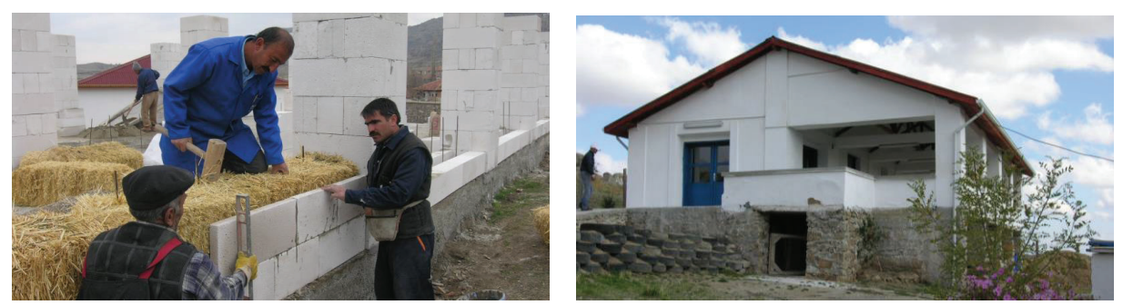
Figure 7. A hybrid construction technique of AAC blocks and straw bales was used for the Kerkenes Stone Conservation Building.