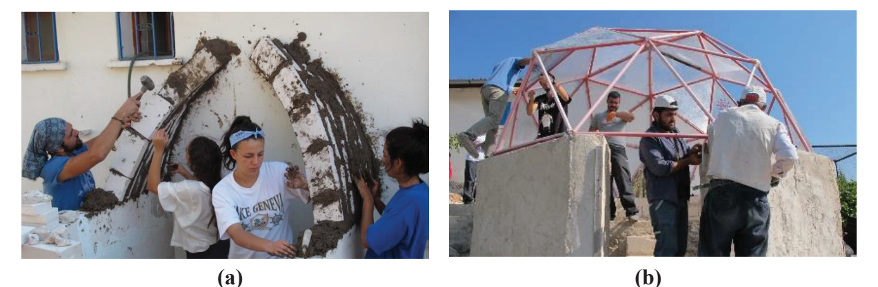
Figure 11. (a) A small Nubian vault built with AAC blocks and (b) construction of a geodesic dome during Hands-on course at Kerkenes.

METU hands-on building course, held regularly each year, have provided students with valuable experience and the opportunity to explore freely ideas and designs (Fig. 11). Students together with villagers, masons and workers, have taken part in building activities to improve facilities at the Kerkenes Eco-Center (Fig. 12). Students design and build their projects in small groups.