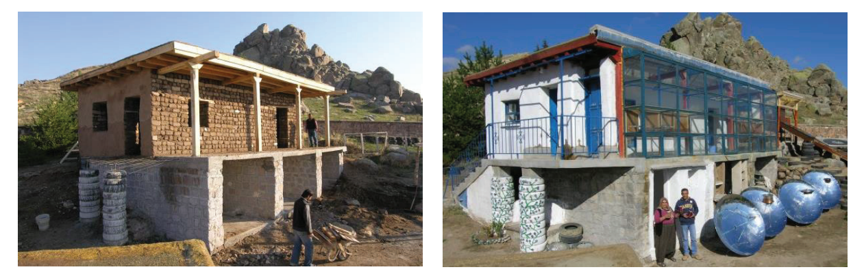
Figure 8. In 2006 the Kerkenes Solar House was built with a south facing solar space.