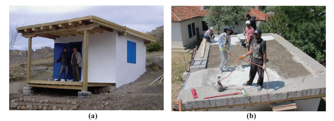
Figure 3. (a) The mudbrick building built in 2002; (b) the mud roof was replaced by AAC blocks during a Hands-on session with METU students in 2012.