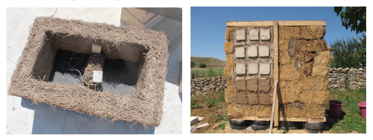
Figure 10. Academic research and experiments on building materials and their properties include the study of lightweight loam and pine-needles (left) and applying different types of mud plaster on straw bale walls to assess their durability (right).