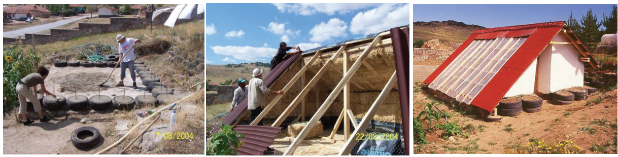
Figure 4. Construction of the Kerkenes Pilot Greenhouse in 2004.

In 2004 and 2005, with generous funding from sponsors, <sup>5</sup> the Kerkenes Eco-Center completed its first straw bale building, the Kerkenes Strawbale House and the Pilot Greenhouse (Figs 4 and 5). Temperature and humidity readings taken from both buildings throughout the different seasons confirmed that they are very energy efficient in winter and minimize the amount of heating necessary to keep a comfortable temperature inside. It was demonstrated that temperature inside a straw bale greenhouse would remain several degrees above freezing outside temperatures when the nights become very cold, thus extending the growing period of seasonal vegetables.