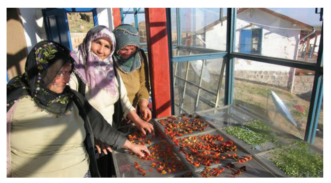
Figure 14. Drying racks in the solar space.