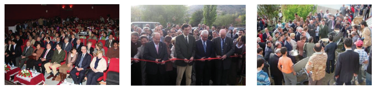
Figure 16. In 2008 the Kerkenes Festival gathered a large crowd and among the visitors were several ambassadors and dignitaries.