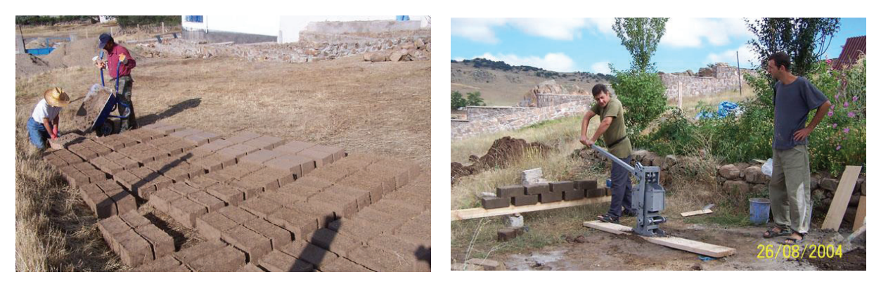
Figure 9. Traditional sun dried mudbricks (left) and pressed bricks (right) were produced at Kerkenes and used for small projects designed by students.

Experimental activities have been made with different materials including reused aluminum cans and glass bottles, mud, straw, pine-needle, lime, paper, AAC, car tires, etc. Research projects include academic research on building materials and their properties. Among research topics are the study of mud bricks, pressed mud bricks and their additives (Fig. 9), lightweight loam and pine-needles as a building material and different mud plasters on straw bale walls (Fig. 10).