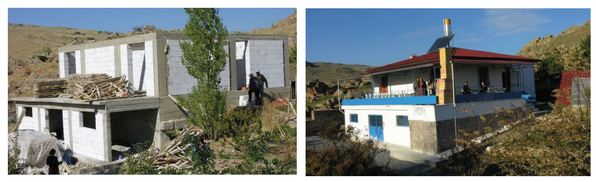
Figure 6. The Erdoğan Akdağ Center was built with a concrete frame and AAC blocks infill.