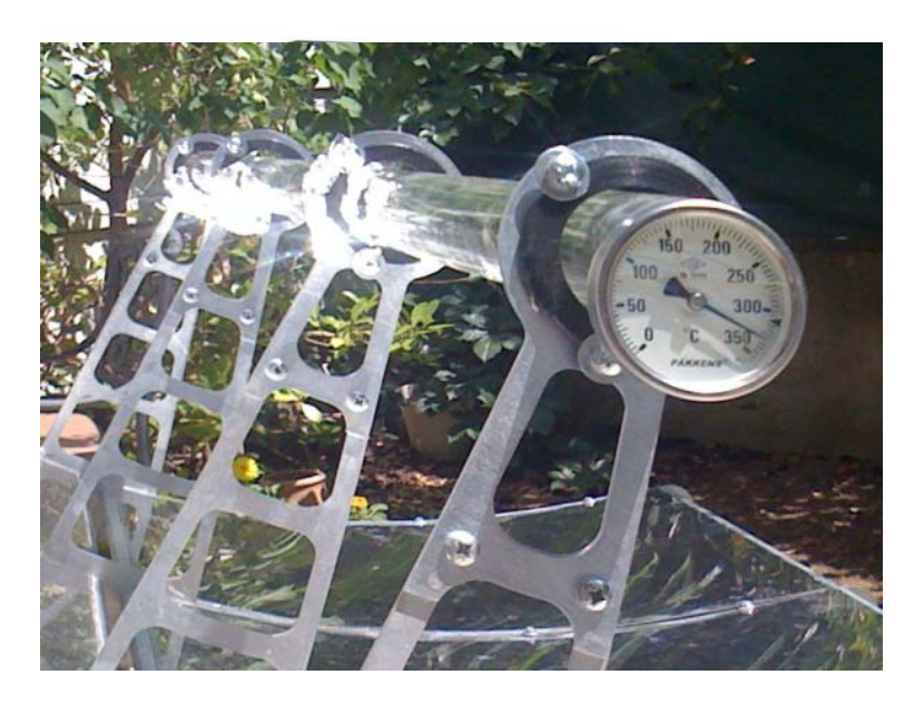
Figure 16. Heat generated inside a glass vacuum tube by the trough parabolic reflector reached almost 350°C