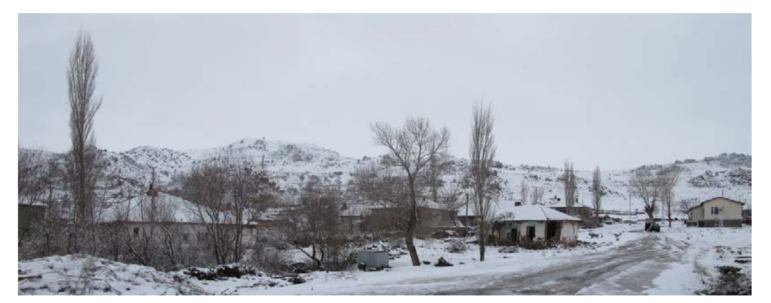
Figure 3. Şahmuratlı village photographed in January 2011 with the Kale in the background. (11dpcg0122)

In 1993 the Kerkenes Project was inaugurated to study the Iron Age capital that had once stood on the Kerkenes Mountain, which overshadows the village of Şahmuratlı, Sorgun, Yozgat (Fig. 3). From the outset, the Project Directors were conscious that this international research project would not only have an impact on the village and the local area, but also that it had potential for development at regional and inter-regional level. A central concern was, and continues to be, that any impact, social, cultural or economic, should be for the benefit of the village and the region.