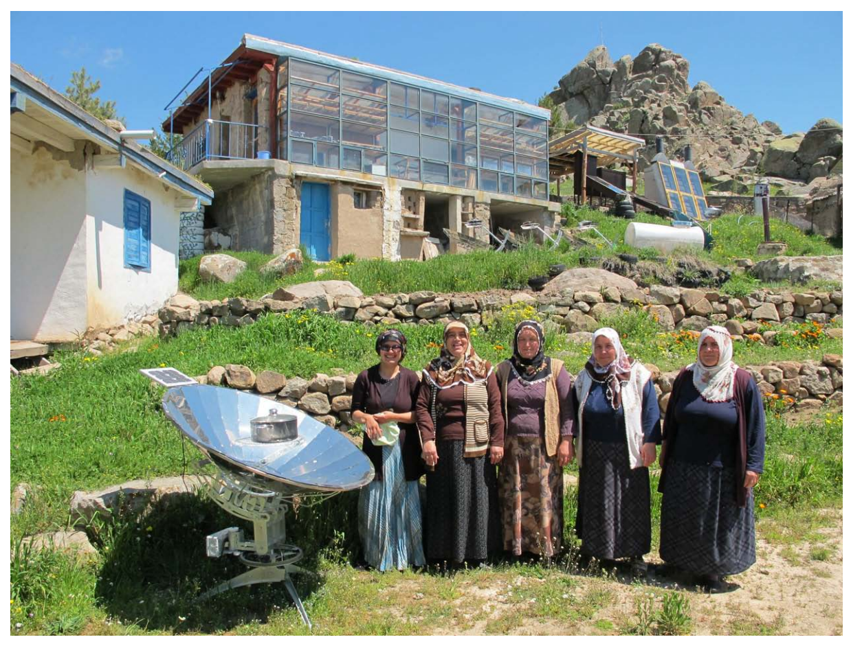
Figure 1. Ladies from Şahmuratlı village posing by the new solar cooker with a motorised sun-tracking mechanism. (11kecg0109)

Submitted by The Kerkenes Eco-Center Project Team Middle East Technical University, Ankara