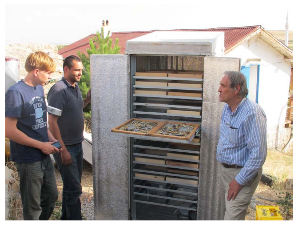
Figure 12. The drying trays are placed on the sliding shelves. The fan is at the bottom of the drying cabinet. (11kecg1106)