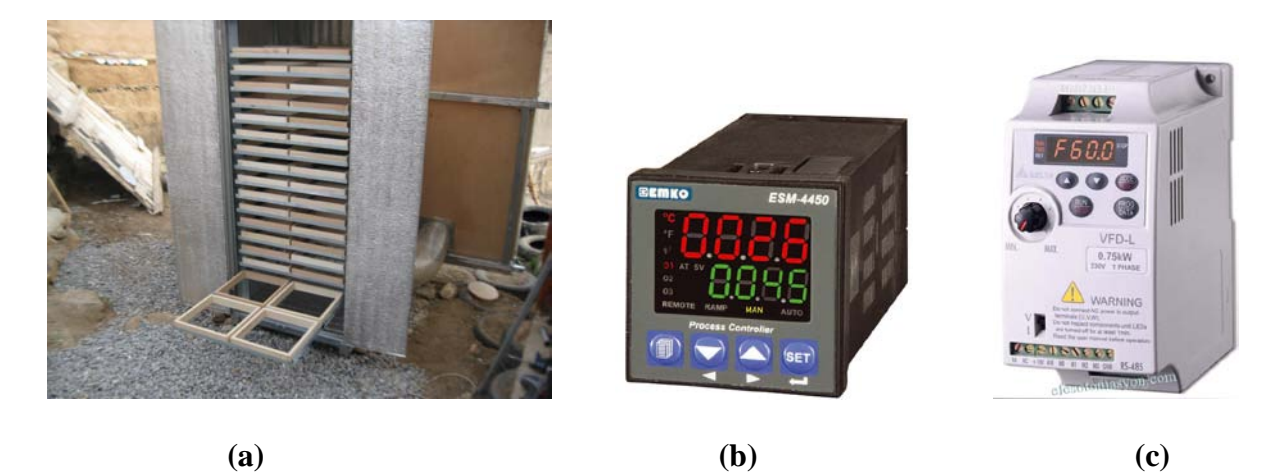
Figure 14. (a) Solar drier cabinet with sleeves on which drying trays are placed. (b) Digital Temperature Control Unit. (c) Motor control device.

Digital temperature control units to control the air temperatures were placed both inside the oven and at the intake chamber. When the temperature of the incoming air exceeded 40^{\circ} C (that is at the beginning of the process, in the morning), the fan starts to operate and forces the incoming air to pass through the drying shelves of vegetables or fruit (Fig. 14).