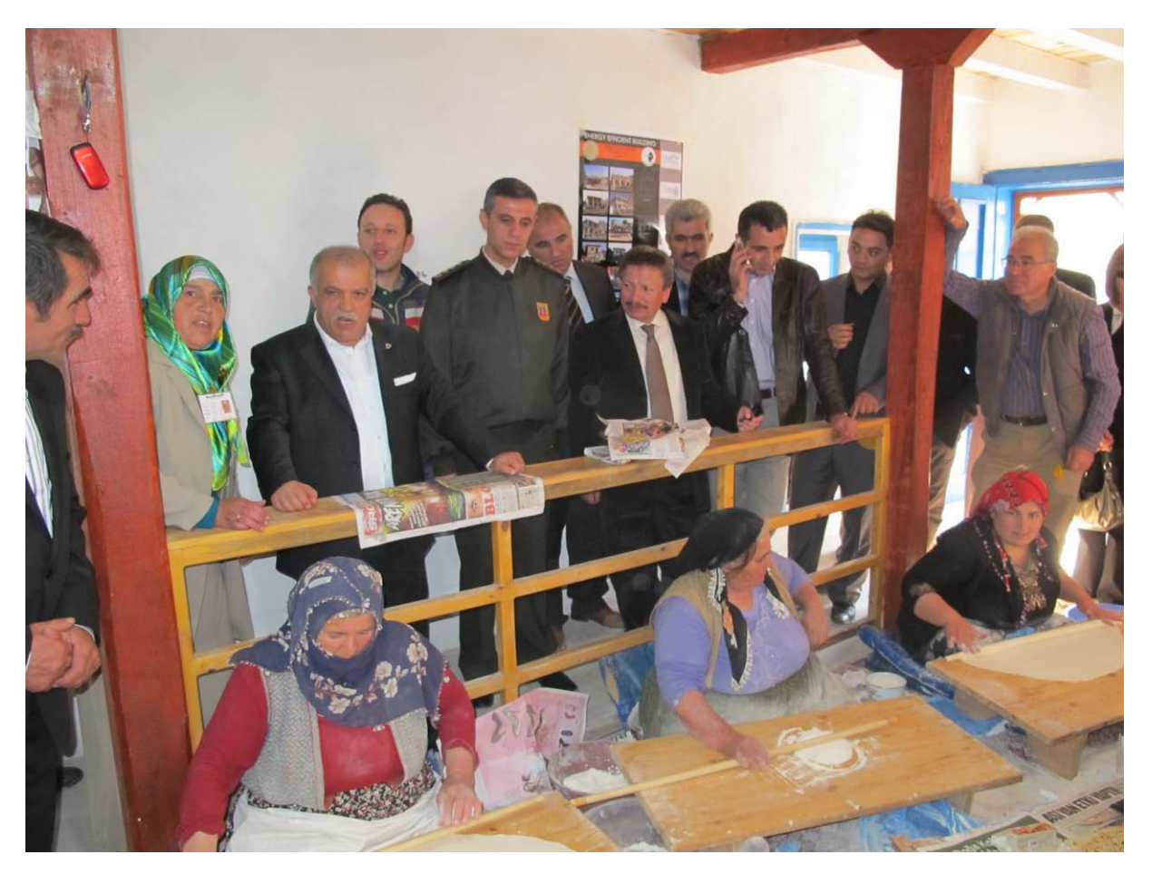
Figure 4. Village ladies thanked the Governor of Yozgat for his help in getting the roof of the solar building repaired and offered him and his guests the içli gözleme, the traditional village bread with fillings. (11kecg1230)

While ongoing research and monitoring by METU faculty and students progresses, adults and children from the village participate so that all those involved benefit and learn from each other.