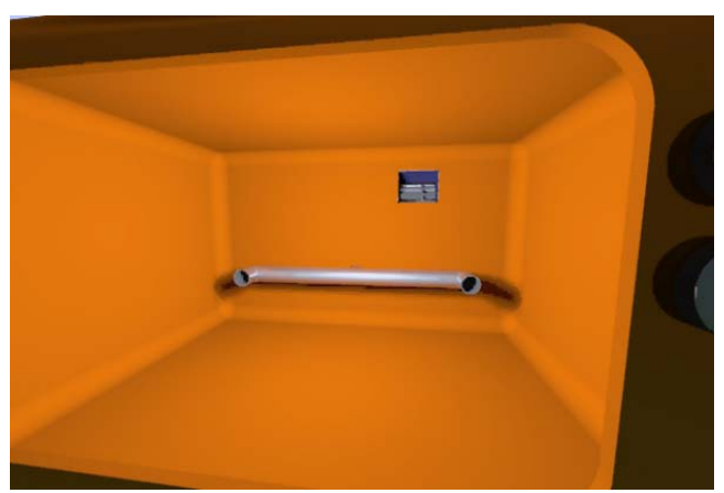
Figure 17. Typical commercial oven to be adapted for solar oven.

Figure 18. Detail of parts needed to attach reflector and vacuum glass tube.