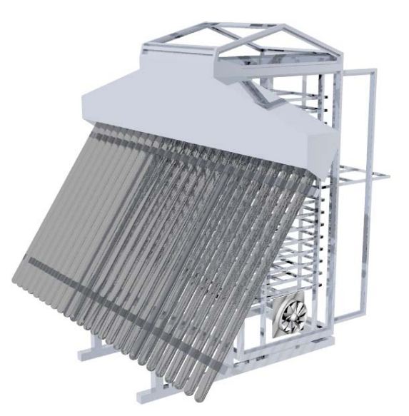
Figure 13. The proposed design improvements for the vertical solar drier.

In 2011, a new dryer model was introduced to the people living in Şahmuratlı village and we have used twenty vacuum tubes commercially available for water heating, instead of the solar heating panels. The vacuum tubes are used to heat the air that will circulate inside the drying oven (Fig. 13). In this new design development an electric fan was used to force the internal air circulation. The fan placed on one side of the drying cabinet, near the bottom, is controlled by a set of thermostatic switches to maintain the correct amount of air with correct temperature.