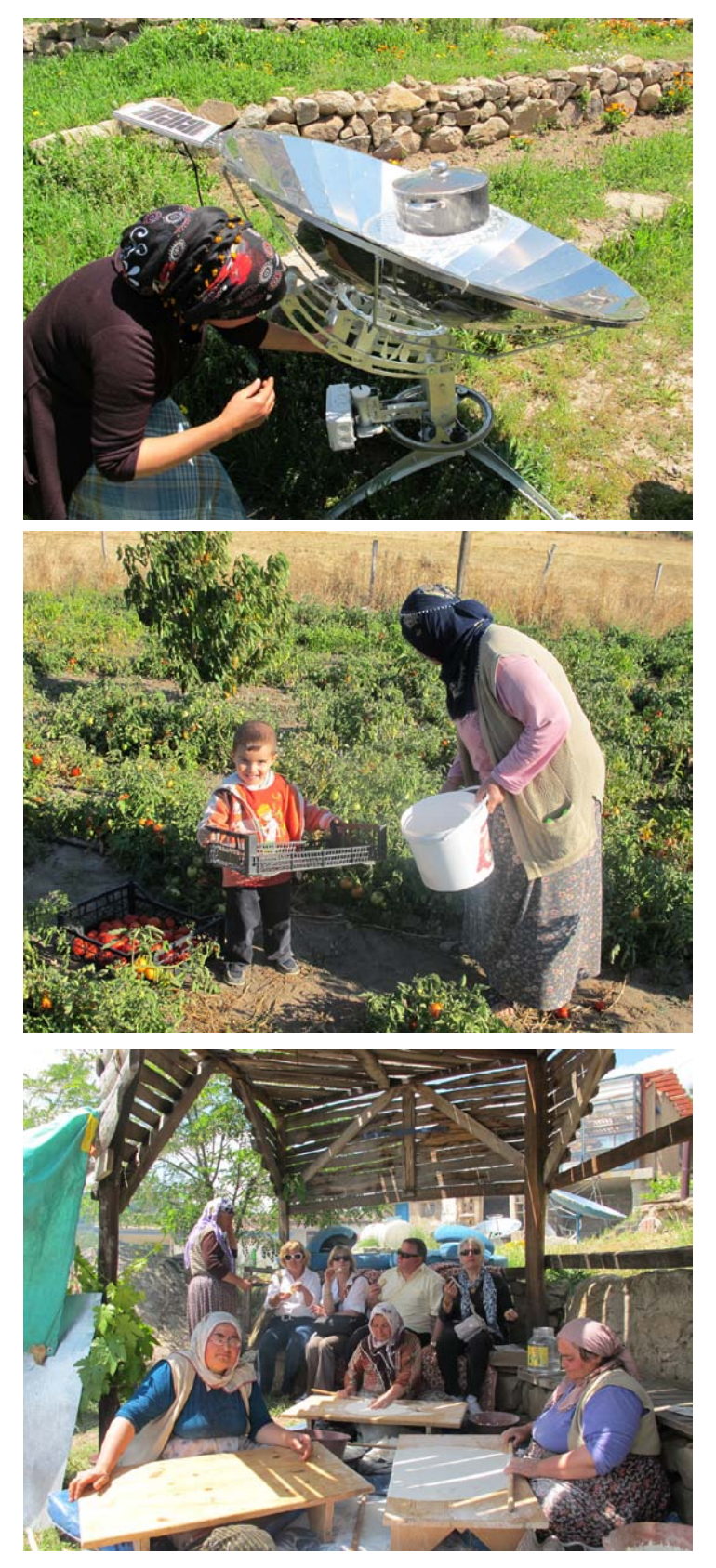
Figure 8. Adjusting the motorized solar cooker. (11kecg0111)

The sun tracking solar cooker turned by a solar powered motor was used during the summer months to cook meals for the Kerkenes team as well as for groups of visitors (Fig. 8). Solar drying and cooking skills have been acquired by several village ladies who train others. Visitors take home packets of dried products, light and easy to carry. Most of the garden products are grown in the village (Fig. 9). In June we were pleased to host the AICC committee members. As the Solar Building was under repair the ladies worked under the small shelter in the garden (Fig. 10).