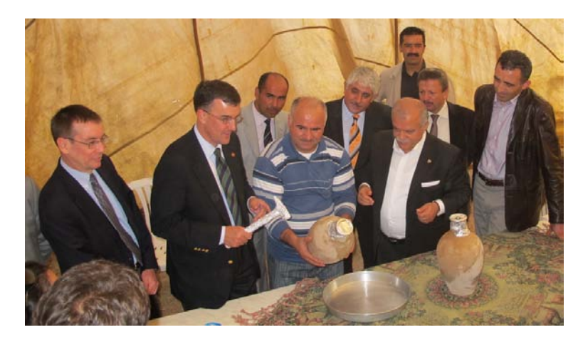
Figure 6. Australian Ambassador Biggs and the Governor of Yozgat breaking open the testi kebab. (11kecg1204)